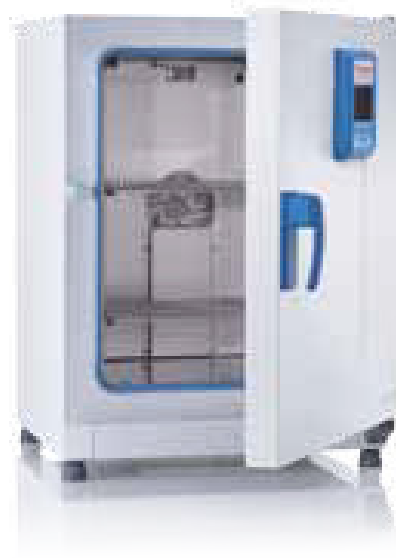
All Heratherm Advanced Protocol Security ovens are available in coated or stainless steel exterior. (model 100 L shown)