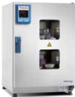
viewing windows in 180L Unit

*maximum temperature for ovens with view package is 250 °C