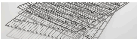
Wire mesh shelves