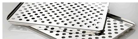
Stainless steel perforated shelves