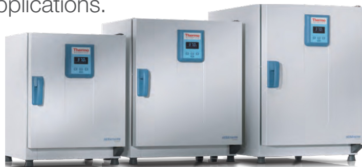
Heratherm General Protocol Ovens, 60 L, 100 L, 180 L models