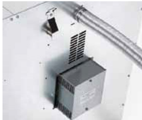
Underbench installation kit

Custom solutions available for table top ovens cable testing applications, clean room applications, and inner casing with conditional gas-tightness for inert gas applications. Access ports can be provided for large capacity ovens at preferred positions