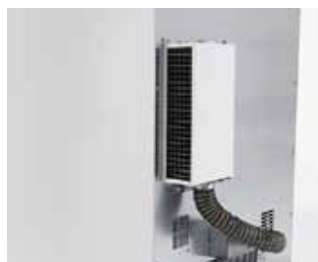
Fresh air particle filter