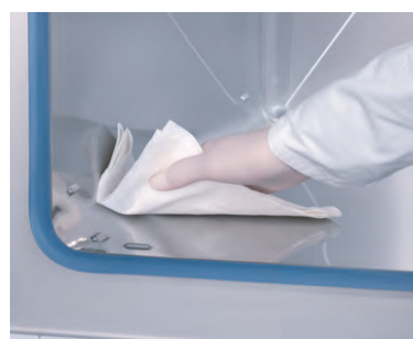
Smooth inner chamber with easy to clean rounded corners