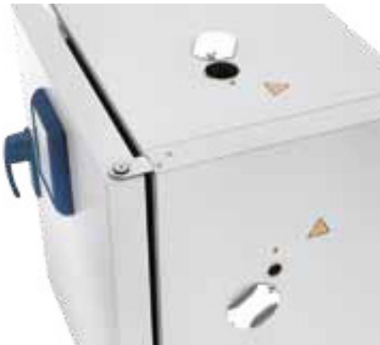
Additional access ports top and right