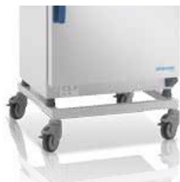
Support stand with casters