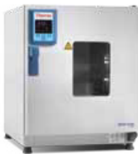
Viewing window in 100L unit