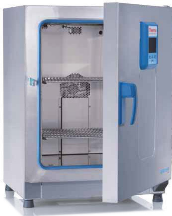
100 L model shown