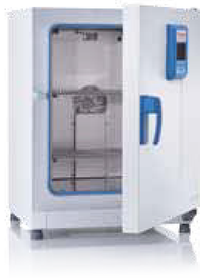
All Heratherm Advanced Protocol Security ovens are available in coated or stainless steel exterior. (model 100 L shown)