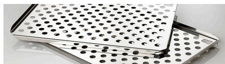
Stainless steel perforated shelves