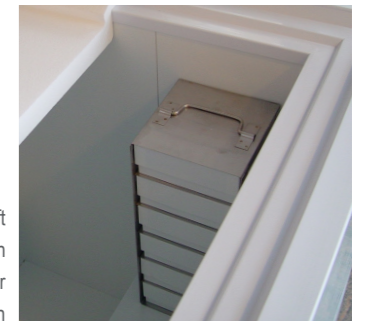
Inner lids (left hand side) which are mandatory for optimized function